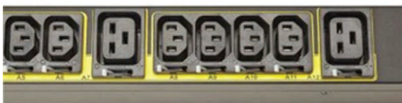
Figure 1. Rack PDUs with IEC outlet grips can reduce the risk of plugs getting bumped loose and leading to server shutdown.

In addition to cable management, power is also another component of rack hygiene, which is where UPSs and PDUs come in. To ensure maximum uptime and improve reliability, network closets should ideally contain redundant UPSs and PDUs to protect both primary and redundant equipment power supplies. However, not all network closets require fully redundant protection; by mixing and matching UPSs with PDUs, administrators can devise the right level of protection to suit their network closet needs. Typically, there are three levels of protection: