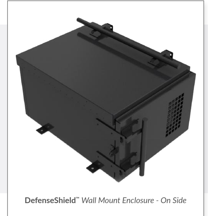
DefenseShield™ Wall Mount Enclosure - On Side

The DefenseShield™ Wall Mount Enclosure provides military-grade shielding in a small size for convenient wall mounting. Perfect for shielding sensitive network devices.